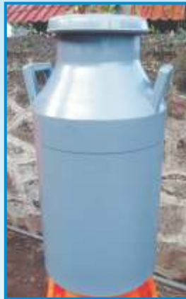
50 Ltrs. Can