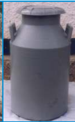
40 Ltrs. Can